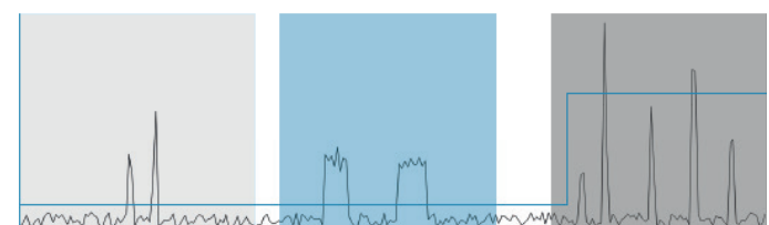
Figure 3: Acquisition regions to look for triggers